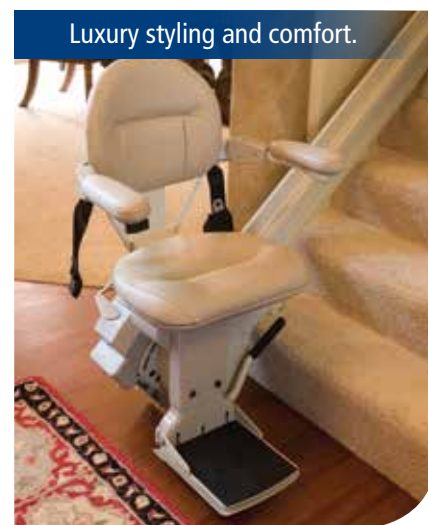
Luxury styling and comfort.