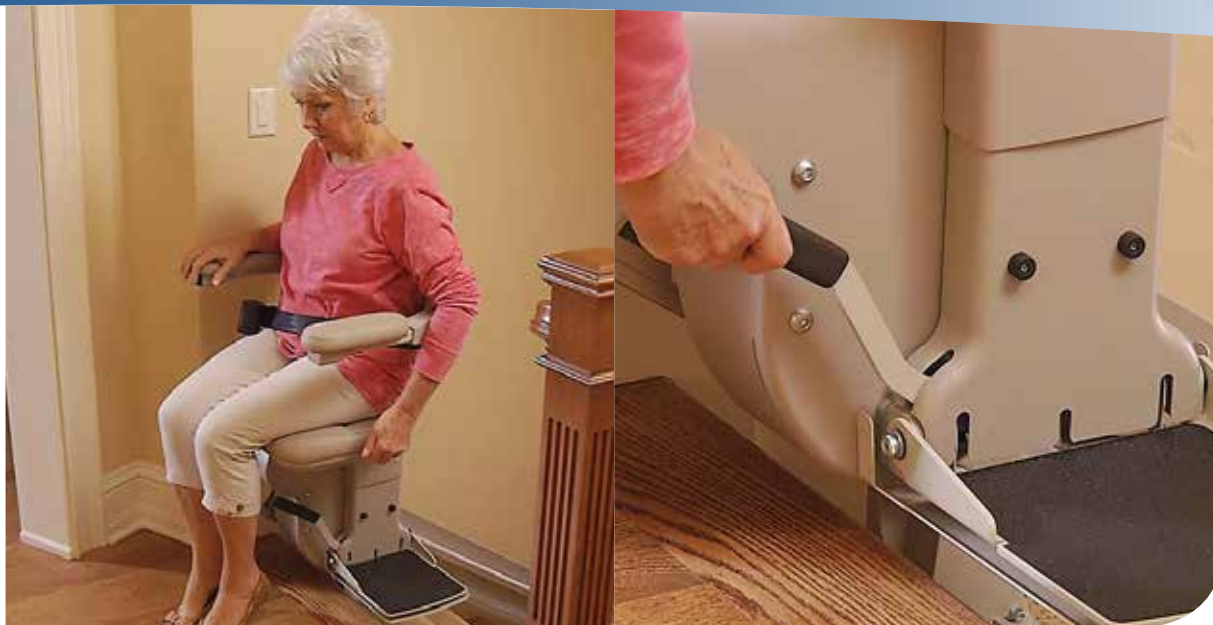
Offset swivel seat makes it easy to get on/off.