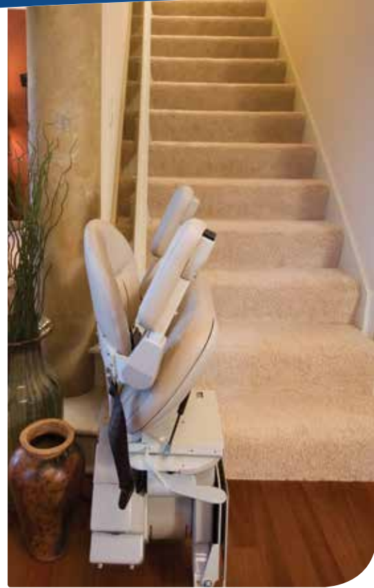
Close installation to wall.