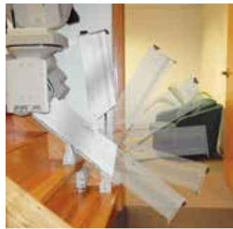
Power or manual folding rails for narrow hallway or when doorway is at the bottom of stairs. Manual operation or push button automatic.